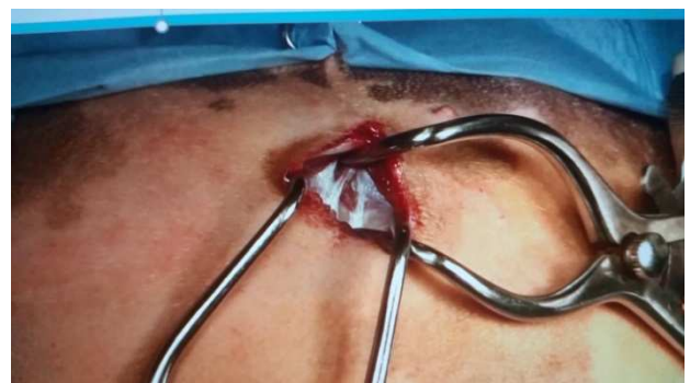
Figure 2. 90° degree positioning of Gelpi retractors.