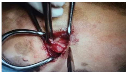
Figure 3. Traction and incision of the pericardium.