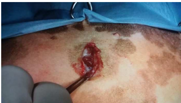
Figure 1. Skin incision.