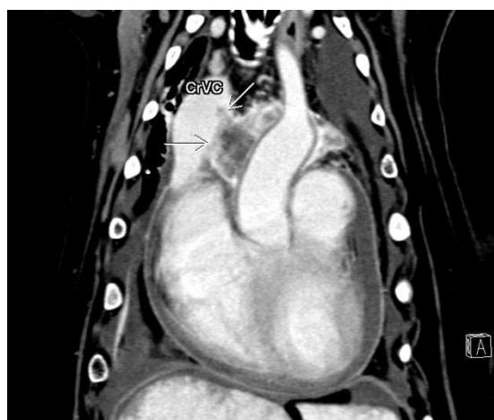
Figure 4. CT coronal scan-chemodectoma with invasion of the cava vein.

\mu g/dl). Recurrence of the pericardial effusion was absent in all the dogs. All the removed portions of the pericardium were measured in their full extension. The mean surface area of the resected pericardial membrane was of 28.50 cm 2 (15 to 48 cm 2 ). All the removed portions of pericardium were histologically examined. In all the subjects the histological diagnosis was of lymphoplasmacellular pericarditis with low/medium grade fibrosis. The mean age of disease presentation was 9.93 years (range 4 to 15), with the majority of subjects 8-13 years old. The mean weight of the patients was 21.5 kg (range 7 to 45 kg) with the majority of subjects weighing more than 15 kg. The average survival time of subjects with suspected haemangiosarcoma was 6.5 months (range 1-14 months) while that of subjects with suspected chemodectoma was 2 years and 8 months (range 5 months-4 years). In three of the nine cases with hemangiosarcoma the death is certainly due to sudden rupture of the mass with acute bleeding (post mortem necropsy).